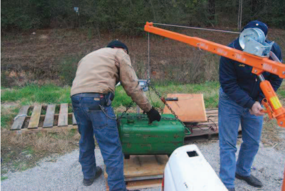
Figure 4 – Weighing Portable Tank to Within a Tenth of a Pound

During testing, fuel consumption was measured in 17-gallon portable weigh tanks that accommodated 1 test run on a single fill. The weight of fuel consumed after each 41.6-mile run was measured on an Ohaus Champ II Model CH300R digital scale with a 650 pound capacity. Scale calibration was checked before and after each stage of testing. The same drivers remained with both the control vehicle and the treatment vehicle for the duration of testing.