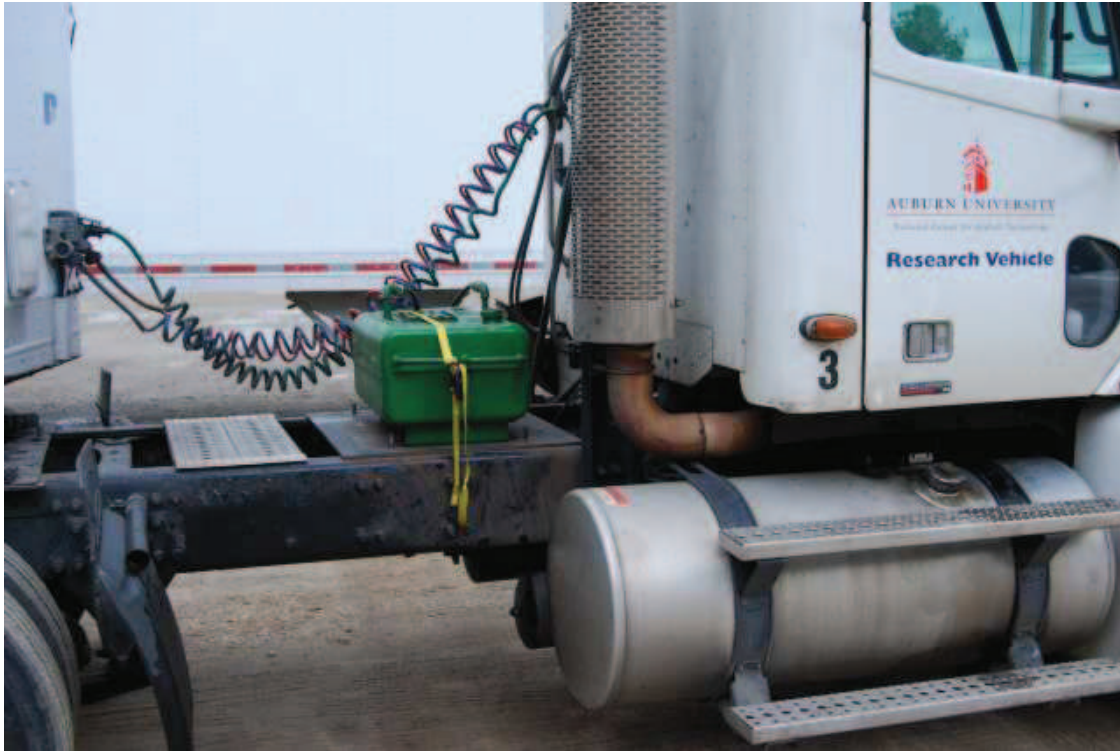
Figure 3 –Portable Weigh Tank

within the prescribed 2 percent filtering band were used to compute an average value representing each segment of testing.