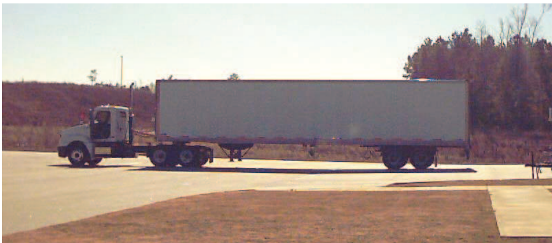
Figure 1 – Truck Configuration Used During the Testing Process

All fuel used was ultra low sulfur #2 diesel, verified by specific gravity at the time of testing. Any accessories that would have pulled auxiliary power were used in an identical manner in both tractors during all stages of Type II testing. Mirrors and windows were maintained in the same position for all stages of operation. Tire pressures were adjusted as necessary prior to the first test run on each day to ensure that all tires were within 5 psi of the manufacturers’ recommended cold inflation temperatures. Each tractor pulled standard cargo van trailers that were loaded to a GVW of 76,500 Lbs.