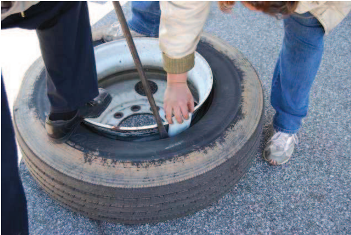
Figure 5 – Installation of Counteract Balancing Beads